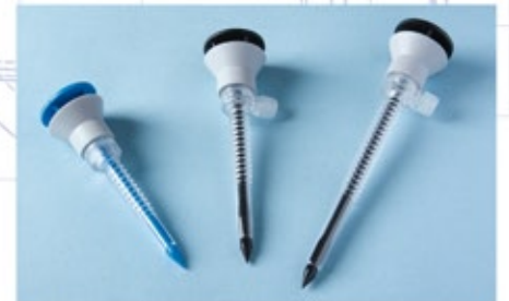
REF : 5 053, 5 068, 5 100