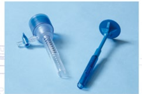
REF : 11 100 S