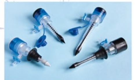
REF : 12 060, 12 100, 12 100H, 11 060, 11 100